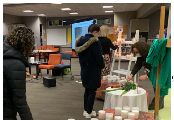
9 | Page